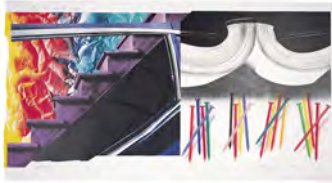
James Rosenquist Off the Continental Divide , 1973-74 Multicolor lithograph on ivory wove Japan handmade paper 42 15/16 x 79 3/16 in. (109.1 x 201.1 cm) Published and printed by Universal Limited Art Editions, Inc. 43 Edition Impressions + 5 APs, 9 AP IIs, 8 HCs, 4 TPs, 2 PPs JR1592OP