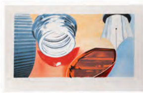
James Rosenquist Sheer Line , 1979 Ten-color lithograph on Arches Cover White paper 29 1/4 x 44 7/8 in. (74.3 x 114.0 cm) Published by Multiples, Inc.; printed by Aripeka Ltd. Editions/Siena Studio 100 Edition Impressions + 1 BAT, 6 TPs, 6 CTPs, 3 PPs, 20 APs, 1 Workshop Proof, 3 HCs JR1593OP