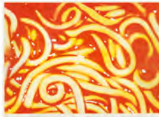
James Rosenquist Spaghetti , 1970 Two-color lithograph on Copperplate Deluxe paper 31 x 42 1/8 in. (78.7 x 107.0 cm) Published by Castelli Graphics/Hollanders Workshop, Inc.; printed by Hollanders Workshop 50 Edition Impressions + 11 TPs, 2 PPs, 9 HCs, 10 APs, 1 additional proof JR1591OP