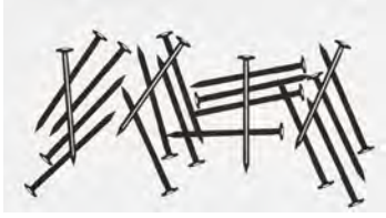
James Rosenquist Nails #2 , 1975 Acrylic on canvas 20 x 36 in. (50.8 x 91.44 cm) JR1590OP